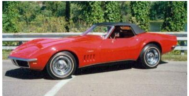
Allen & Fa Lewarchik's 1969 Chevrolet Corvette