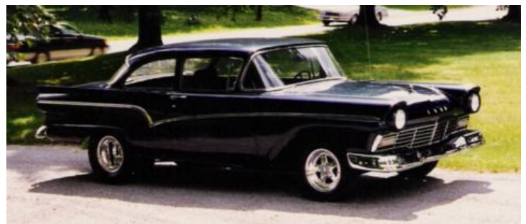
Barb Chevalier's 1957 Ford Sedan